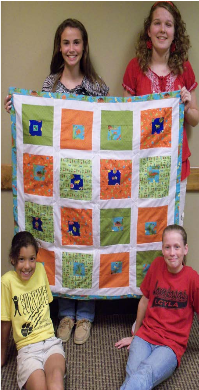
4-Hers completed quilt for 2012 4-H Quilt Challenge

Contact: Jill Carroll at lampasaschamber@sbcglobal.net or 512-556-7435