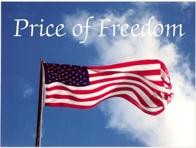
District Photography competition Story Board category: Monica Garza – Best in Class