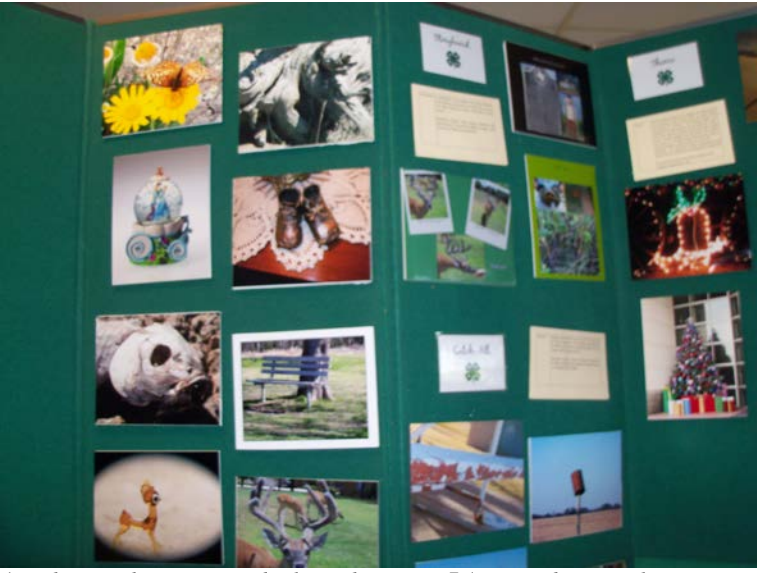
4-H Photography pictures on display at the District 7 4-H Roundup. Be taking pictures now for next year's project.