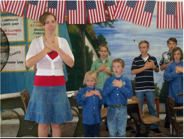
Members of the Kempner Oakalla 4H club saying the 4H Pledge prior to their patriotic speeches on May 24 th at the Oakalla Community Center.