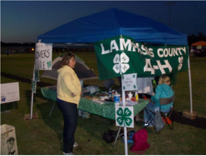
4H Booth at the 2013 Relay for Life. Baked goods, hot chocolate and face painting were the fund raisers. Thanks for the donations of supplies and to those attending the event.