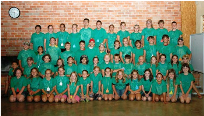
4-Hers from Lampasas, McCulloch, Mason, Menard, Callahan, Coleman, and Concho counties