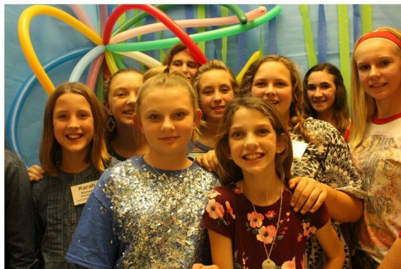
2016 Junior Leadership Retreat