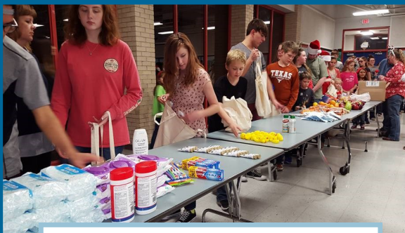
4-Her's pack gift bags (above) and deliver (below)