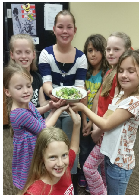
Food Challenge practice