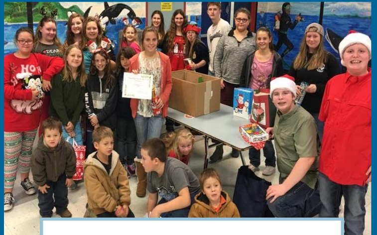
Sulphur Creek Club won the Christmas tree decorating contest