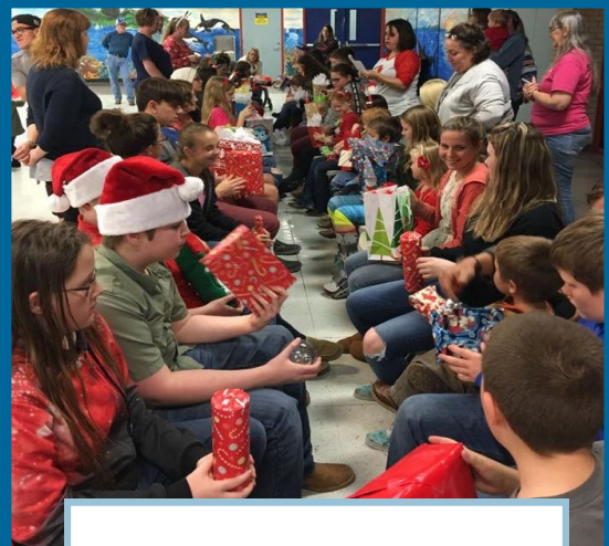
Christmas gift exchange