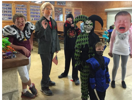
Fun at the Halloween Party!