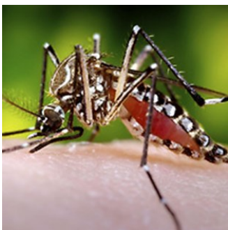
(Aedes aegypti mosquito—James Gatha...jpg)

HOW DO YOU GET IT? The main way the Zika virus is spread is through the bite of certain Aedes species mosquitoes. Mosquitoes become infected when they bite a human who has the virus, and they are then capable of spreading the virus to other susceptible humans. It's recently been shown that the virus can be spread from human to human through infected bodily fluids, but that mode of transmission remains rare.