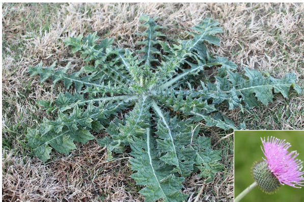
Texas Thistle Cirsium vulgare (Savi) Ten.