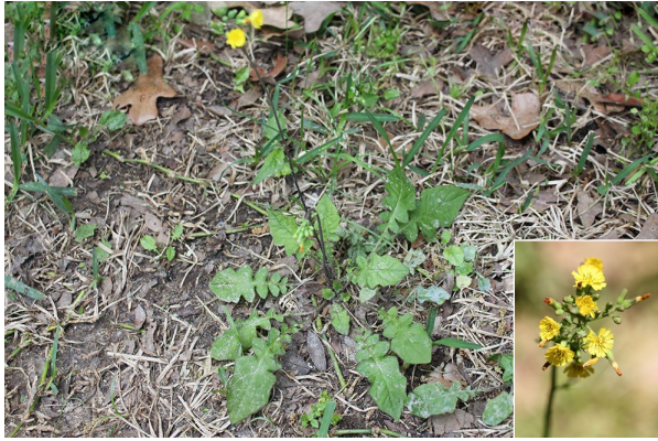
Asiatic Hawksbeard Youngia japonica L.