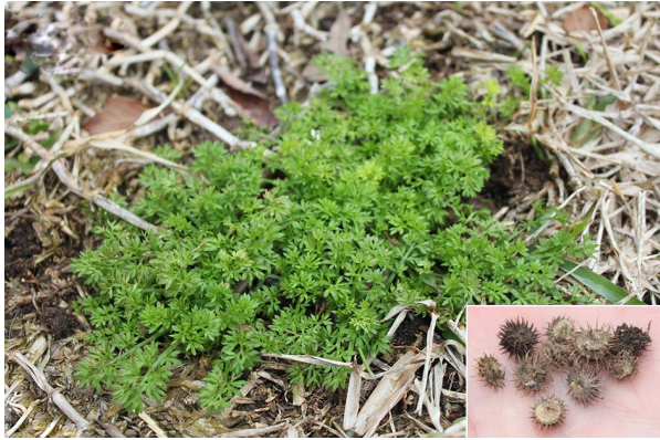
Lawn Burweed Soliva sessilis Ruiz & Pavon